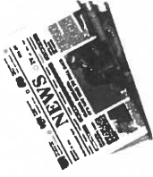
Newspaper (Inserts & telephone books)