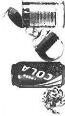
Aluminum & Steel Cans (Empty cans & foil)