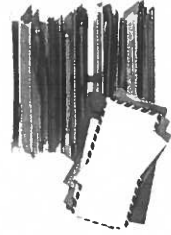
Office Paper (Junk mail & envelopes)