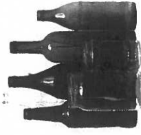
Glass Bottles & Jars (Empty food & beverage bottles & jars)